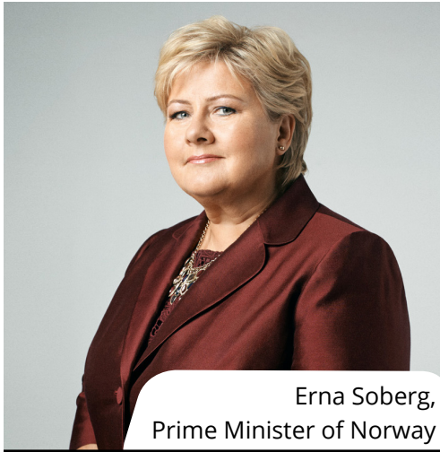
Erna Soberg, Prime Minister of Norway

Angela Merkel tops the list of the world's most powerful women. But Erna Solberg is more powerful than Hillary Clinton.