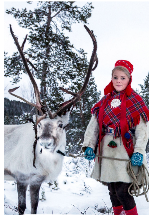
On February 6th, Norway celebrates Saami People's Day celebrating the indigenous peoples of northern Scandinavia